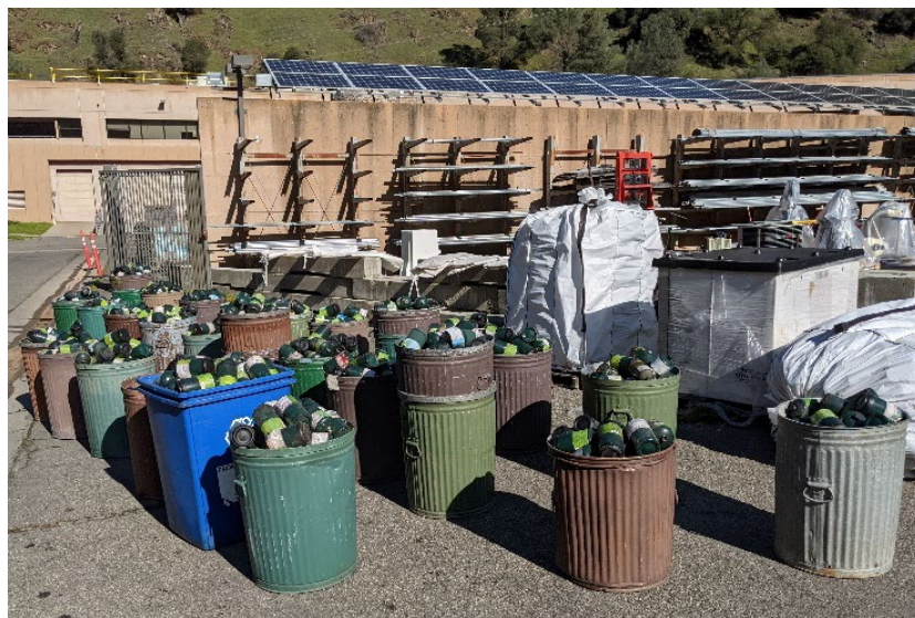
Single-use cylinders collected at Yosemite National Park in 2021

Each year, about four million single-use 1 lb. propane cylinders are sold in California alone. These cylinders power equipment and can be used for camping, cooking, landscaping, heating, and a variety of other applications. Once used, consumers must dispose of these cylinders, but unfortunately are often disposed improperly and at significant cost to local governments and parks. For instance, Yosemite National Park collects around 20,000-25,000 1 lb. propane cylinders every year. Safely disposing these cylinders cost the Park labor and money, which is ultimately funded by taxpayers. 1