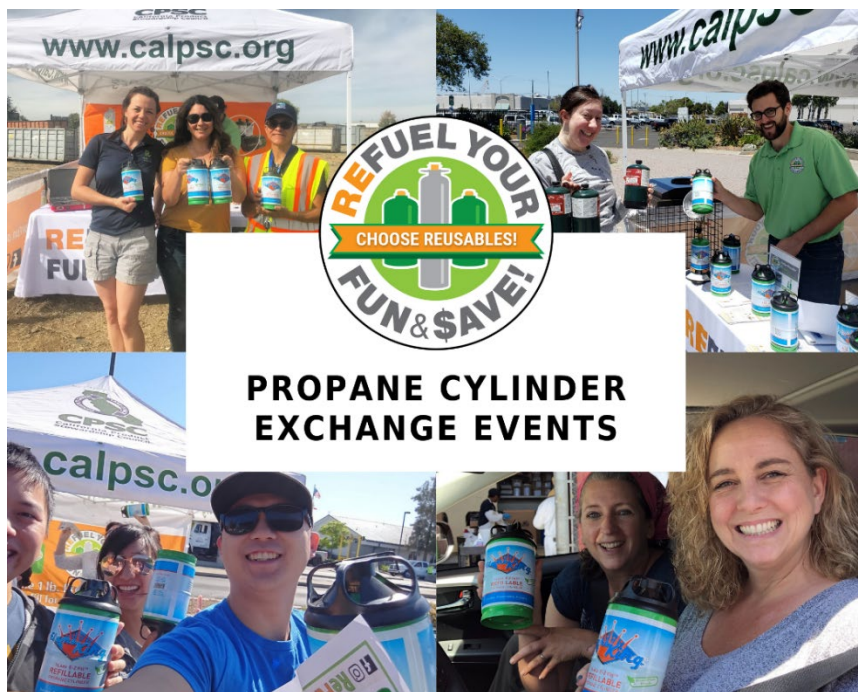
RFYF staff hosted Propane Cylinder Exchange Events. Top left going clockwise: Butte County, West Contra Costa County, Yolo County, City of Huntington Beach

RFYF campaign staff recruits retailers and refill locations of reusable 1 lb. propane cylinders, which can all be found on the RFYF map . RFYF also hosts exchange events, where residents bring empty single-use cylinders and receive a free, reusable one by signing a propane pledge.